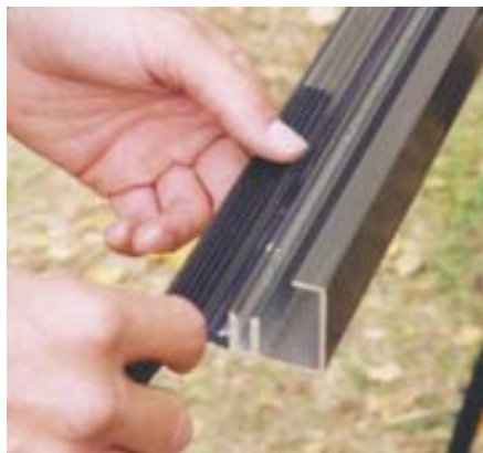
Figure 3. The crew used soapy water as a lubricant to help seat the gaskets in their raceways (left). Because the gasket material has memory, or a tendency to shrink back to its original form after stretching, it's important to install the gasket strips long and let them shrink for several hours before final trimming. The top perimeter bar is installed first, with mitered ends, then the side bars (below).