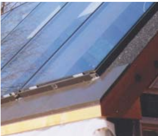
Figure 5. Because every overhead glazing job is different, flashings are custom-bent on site. The first installed is the eaves flashing (above), which goes on before any glazing bars. After the glazing is in place, the side flashings are installed (right).