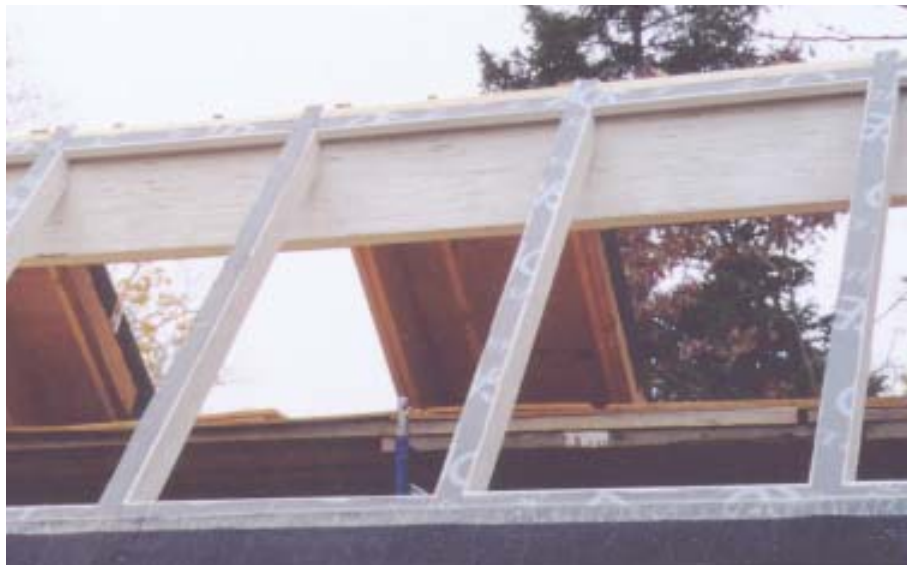
Figure 2. As an extra precaution against condensation staining, the author lined the top edge of the rafter framing with a self-sticking rubberized asphalt membrane.

There are no rough openings in a custom sunroom; it's finish work from the beginning. The upper edge of the sloped framing supports the glazing system and must therefore be as true and square as possible. Headers must be flush at the top with the rafters, and any bumps or crowns must be planed flat. Everything lays out on centerlines; the extruded aluminum bars are a