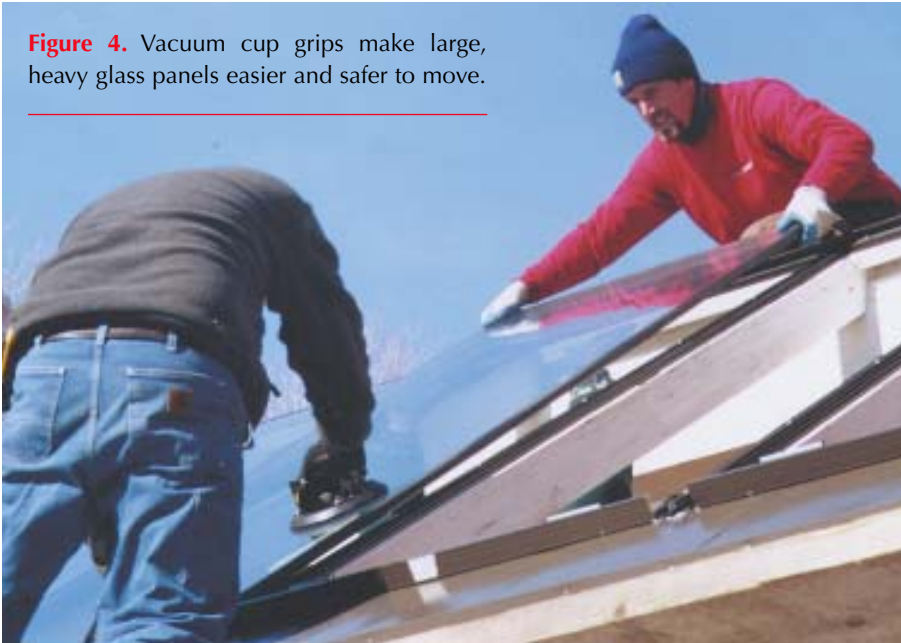
Figure 4. Vacuum cup grips make large, heavy glass panels easier and safer to move.

With the complete base-bar layout screwed to the frame and the gaskets