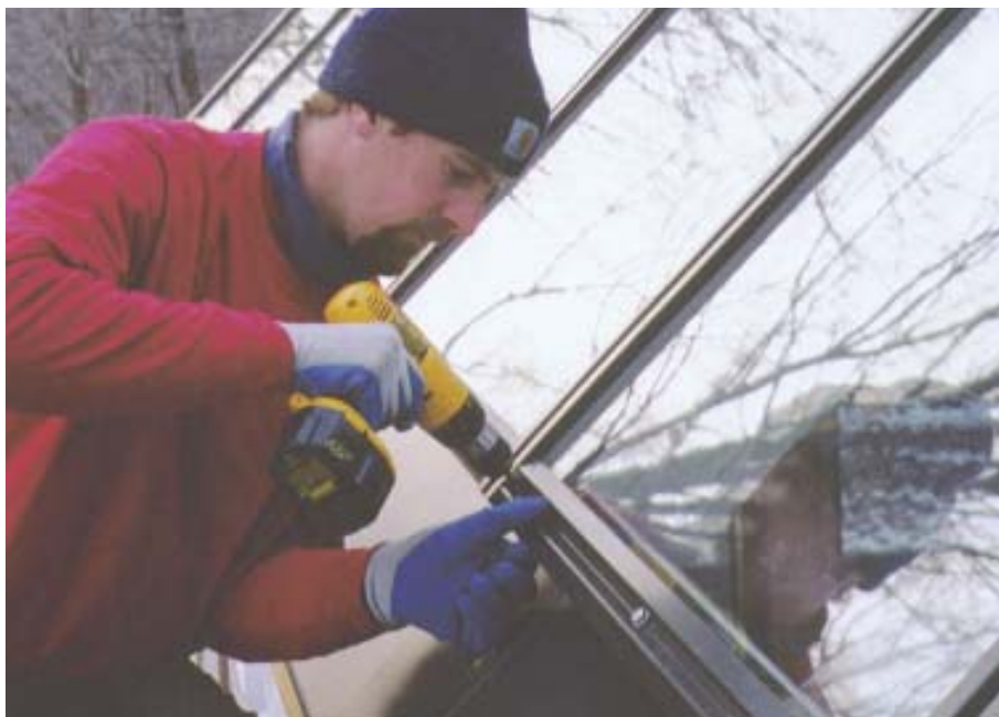
Figure 6. Attaching the gasketed glazing cap makes the installation watertight. A snap-on cover trim will hide the screw heads.

The eaves flashing goes on first, before the extrusions are installed